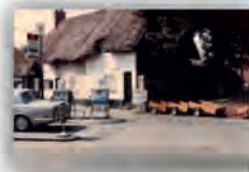
8. Forge Filling Station; Pratts Trailers