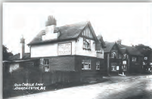
32. Castle Inn 31. Mr Brown's garage & shop

22. Cycle Shop , 21. Crown , 20. The Stores