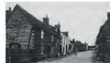
High St looking south Left