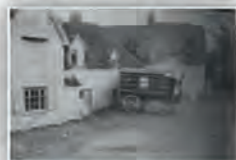
8. Area outside Old Village Hall, nr Coop