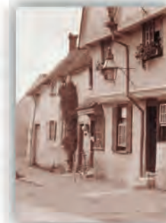
12. The George 13. Nash's Shop