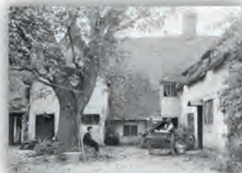
25. Exon's bakery