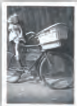
3. Atkins Butchers