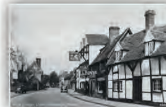
25. Exon's Bakery