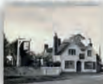
1. The Plough