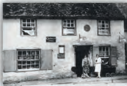
14. Swadling's Carriers & Tickets