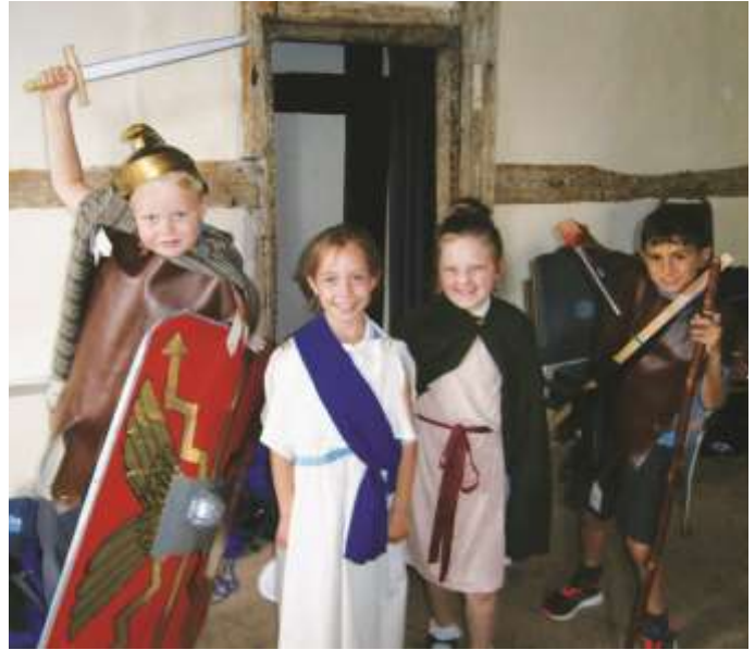
We love dressing up as Romans!

A great deal went on last term, but so much so I'm not going to tell you all about it here, but save it for next month! The most important event was our amazing Roman Archaeological Experience Days! See the in depth report below. The most important upcoming event is our Realms of Glory: A Celebration of Angels exhibition event. The new poster is included in this edition of Dorchester News, but just to let you know we are planning a huge range of great children's and family activities to accompany it! You'll be able to come and try your hand at making some angels wings, as well as seeing the amazing pairs of wings we'll have on display and you can have a photo opportunity with, if you fancy yourself as an angel! We're hoping to have our ever popular pop-up café during some of the family events. We are planning a number of schools workshops too! Make certain to book the dates into your calendar to ensure you come and see the exhibition, find out more about the symbolism of angels in art! More details to follow next month!