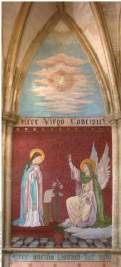
Victorian wall painting of the Annunciation from the Lady Chapel 9 x 20cm

These cards are sold with envelopes in packs of 10 for £4.50 and are colour printed on glossy quality card with 'Happy Christmas' inside and 'Sold in aid of Dorchester Abbey' on the back.