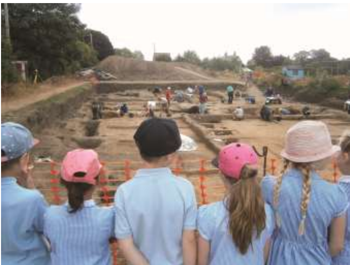
Children get a talk on the local Roman dig in action!