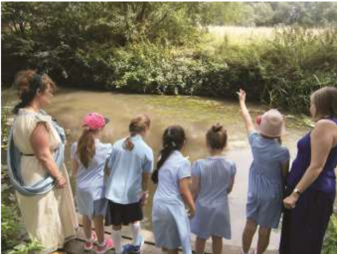
Children enjoy re-enacting a pagan rite to the Romano-British river goddess Coventina. They are throwing things into the river in the hope that the object of their curse tablet is recovered!