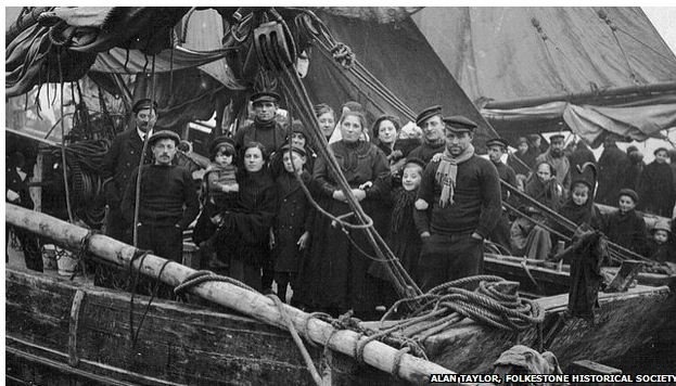
Belgian refugees arrive at Folkestone, 1914

In the autumn of 1914, Britain faced the largest single influx of refugees in its history, when almost 250,000 Belgians crossed the channel following the German invasion of their country (see BBC News Magazine 15 September 2014). Newspapers of the time were full of stories and cartoons of atrocities committed against Belgian civilians, but their sojourn in Britain, particularly at village level, remains a largely untold story. Most of the refugees returned to Belgium after the war, leaving little trace of their presence.