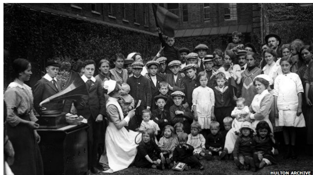
Belgian refugees in London

We next hear of the refugees in December 1914 ( Parish Magazine No. 318). The local community in Dorchester and neighbouring villages and towns rallied to their support, at the same time as anxiously awaiting news of family members who had gone to war, and getting the home front effort under way. 41 people had supplied items to furnish the house, making it habitable in two days. Others had donated clothes, vegetables and jam, and 104 had given money through weekly subscription. Donors came from all levels of village society, Manor and church and cottages, and the lists of contributors, not surprisingly dominated by women, contain many of the familiar 'old village' family names [the full lists appear in the Parish Magazine ].