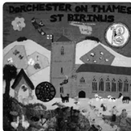
Tapestry created by pupils for The Thames Heritage Tapestry Project.